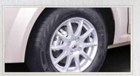
ALLOY WHEELS COMPLEMENT THE CAR SUPERBLY WHILE LENDING IT JUST THE RIGHT AMOUNT OF CHARACTER.