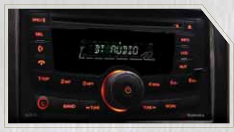
WITH THE LATEST BLUETOOTH STEREO SYSTEM NESTLED IN THE CENTER Console, and a Microphone neatly integrated into the Roof, your phone and car are finally one