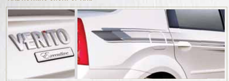
CUSTOM DESIGNED BADGES AND CLASSY DECALS EMBELLISH THE EXTERIOR OF THE CAR. THEY GIVE THIS SEDAN ITS EXECUTIVE FEEL AND ALSO HIGHLIGHT ITS EXCLUSIVITY.