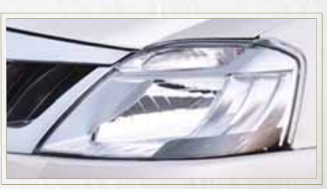
BLUEVISION HEADLAMPS ILLUMINATE YOUR PATH, ENHANCING VISIBILITY WHILE ALSO ADDING SUBTLE COLOUR TO YOUR ARRIVAL.