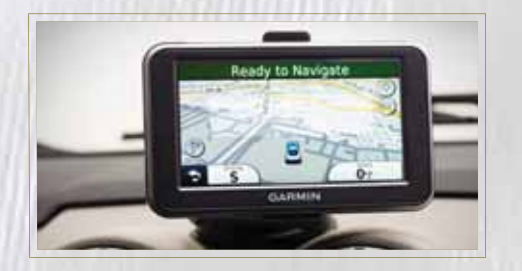
A STATE-OF-THE-ART NAVIGATION SYSTEM IS ALWAYS STANDING BY TO ASSIST YOU, YOU'LL NEVER HAVE TO HALT FOR DIRECTIONS AGAIN.