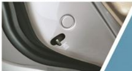
Child Protection Rear Door Locks: Prevent inadvertent door opening to protect your little ones.