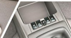
4 Door Power Windows: For comfort and convenience of operating windows at the touch of a button.