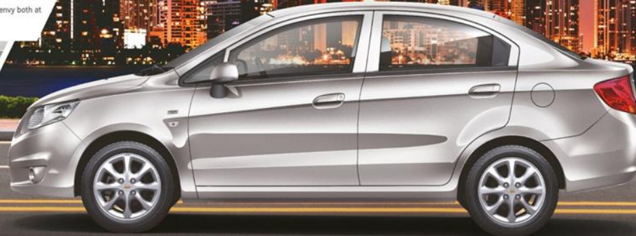
Dynamic Sculpture Design