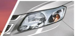
Hawk-Wing Style Front Headlamps: Add a swanky dimension & visual impact of the bold front styling.