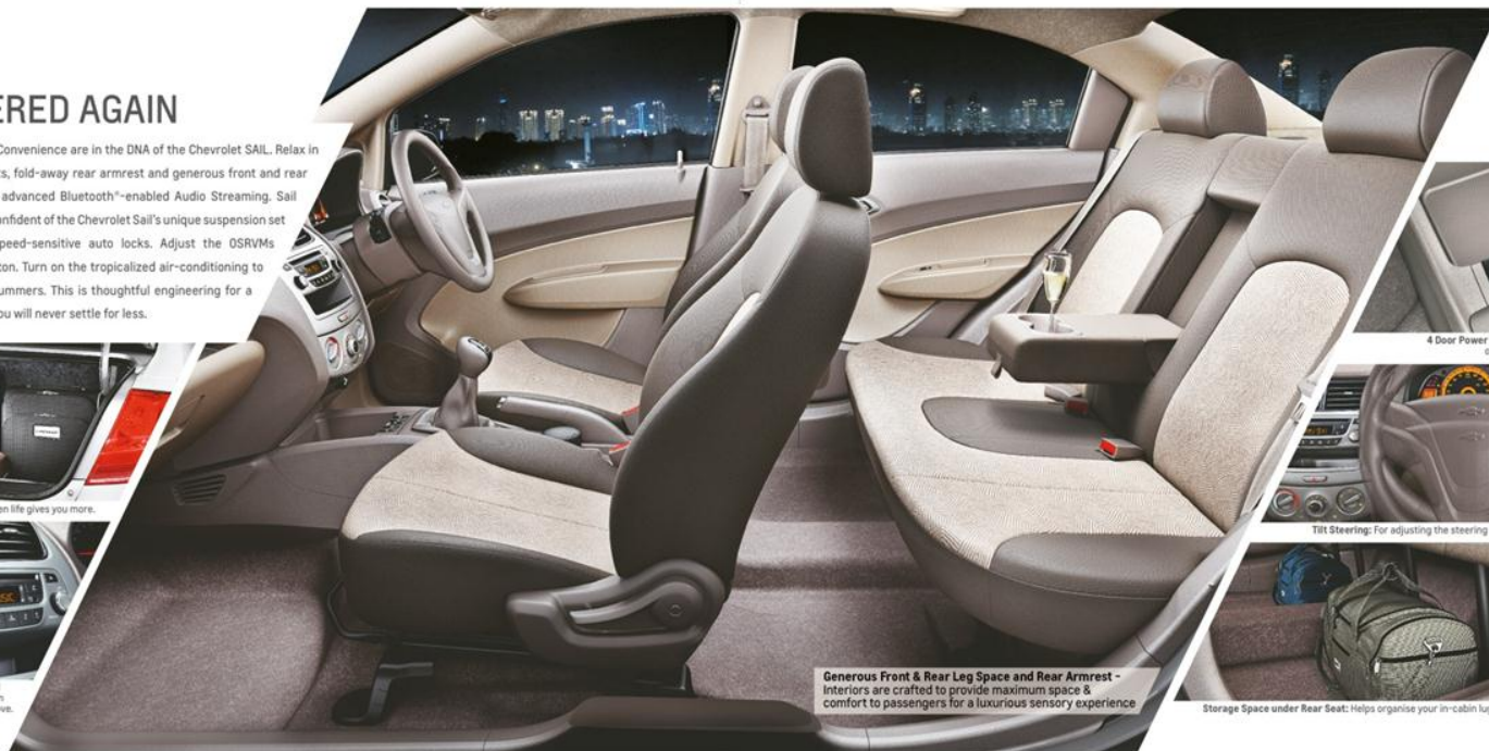
Generous Front & Rear Leg Space and Rear Armrest - Interiors are crafted to provide maximum space & comfort to passengers for a luxurious sensory experience