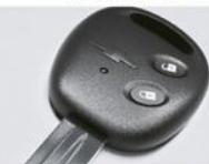
Engine Immobilizer with Remote Keyless Central Door Locking: For enhanced security of your car.