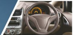
Collapsible Steering: An additional safety feature for driver protection in case of frontal impact.