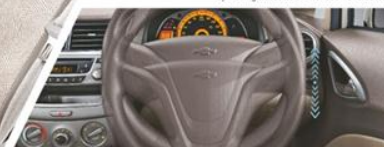
Tilt Steering: For adjusting the steering wheel angle for enhanced driving comfort.