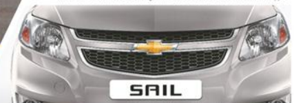
Dynamic Sculpture Design with Bold Front-end Styling: Adds premium appeal to the aggression of the taut and sculpted form.