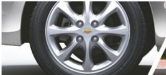
Alloy Wheels: Stylish & sporty 8 Spoke, 14 inch alloy wheels enhance appeal & performance.

The Chevrolet SAIL belongs to those who stand out. An aggressive and macho front styling based on the Dynamic Sculpture Design philosophy, along with its wide stance lends it an unmatched grace and awe inspiring presence. Elegant finish and broad shoulders apart, the muscular physique of the Chevrolet SAIL gets glamour to the grace with its elegant wide-angled jewel-effect tail lamps and wrap around head-lamps. The stunning Chevrolet Corvette inspired Dual Cockpit Interior Design with a refreshing Rising Sun instrument cluster, luxuriously blended two tone interiors with highlights in silver and chrome, define the overall appeal and charm of the Chevrolet SAIL that commands respect and envy both at the same time.