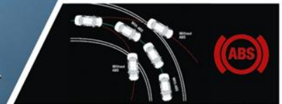
ABS + EBD: Prevent wheel lock to ensure you retain steering control during emergency braking manoeuvres.