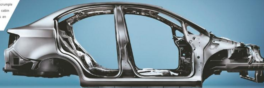
Chevrolet Safe-Cage Design - Cocoon of safety