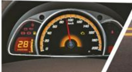
Rising Sun Style Instrument Cluster: With a Digital Tachometer.