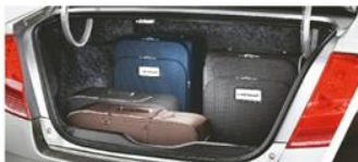
Superior Boot Space: To fit in your world when life gives you more.

Luxurious Comfort and Ergonomic Convenience are in the DNA of the Chevrolet SAIL. Relax in the comfort of well-supported seats, fold-away rear armrest and generous front and rear legroom. Enjoy the drive with the advanced Bluetooth™-enabled Audio Streaming. Sail comfortably over pot-holed roads confident of the Chevrolet Sail's unique suspension set up. Drive off smiling with the speed-sensitive auto locks. Adjust the OSRVMs electrically at just a touch of a button. Turn on the tropicalized air-conditioning to enjoy a cool breeze in the harsh summers. This is thoughtful engineering for a rejuvenating driving experience – you will never settle for less.