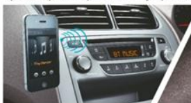
Fun Wide Audio System: Bluetooth™ enabled Music Streaming & Mobile Hands-free system transforms your car into a jukebox on the move.