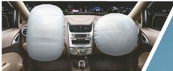
Dual Airbags: Cushion the front seat occupants & provide protection during high speed frontal impact.

The Chevrolet SAIL comes with an unmatched set of active and passive safety features. Its Safe-Cage Design with a 3-point force dispersion structure with in-built crumple zones and side impact beam in doors provides enhanced safety for the cabin occupants. The centrally-located fuel tank fortified by cross-structures is an added protection in case of a side impact. Made of sterner stuff, well it's true.