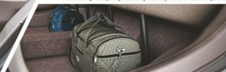
Storage Space under Rear Seat: Helps organise your in-cabin luggage without having to stow it in the boot.