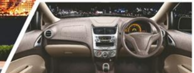
Chevrolet Corvette-Inspired Dual Cockpit design: With wide horizon view dash design enhances functional & aesthetic interior appeal.