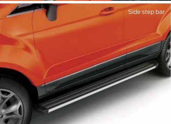
Side step bar