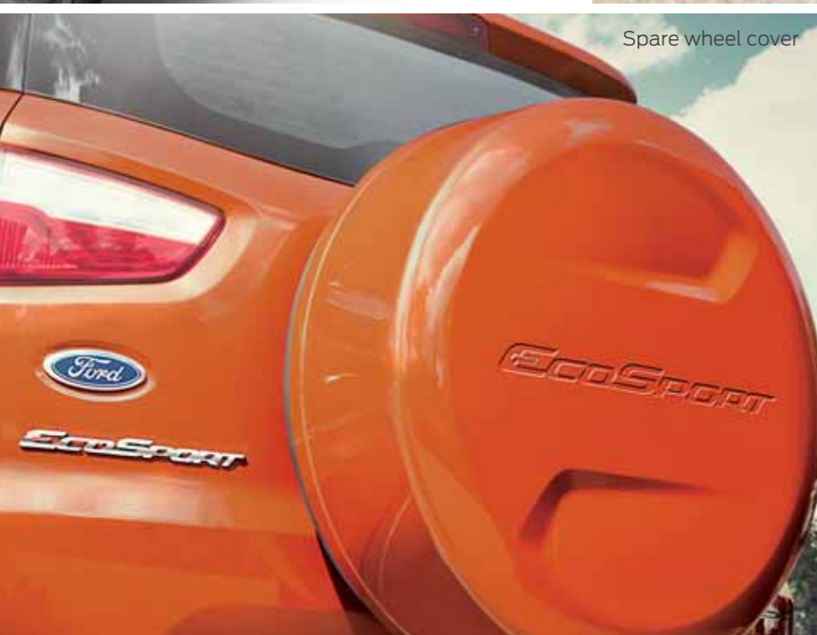
Spare wheel cover