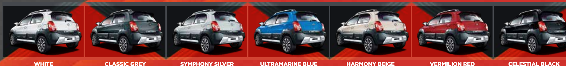
WHITE CLASSIC GREY SYMPHONY SILVER ULTRAMARINE BLUE HARMONY BEIGE VERMILION RED CELESTIAL BLACK